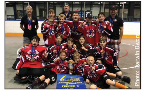
Pee Wee C Gold-Shuswap