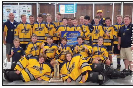
Bantam B Gold-Comox Valley