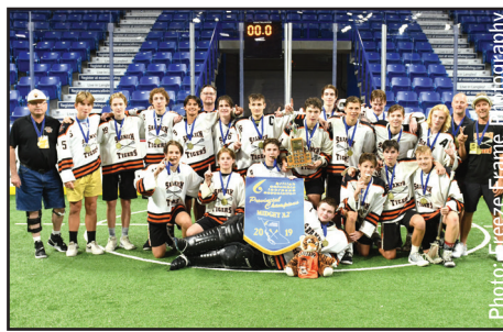
Midget A2 Gold-Saanich