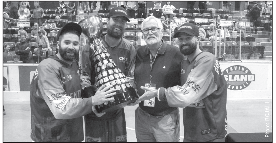
Peterborough wins their 17th Mann Cup title in club history.