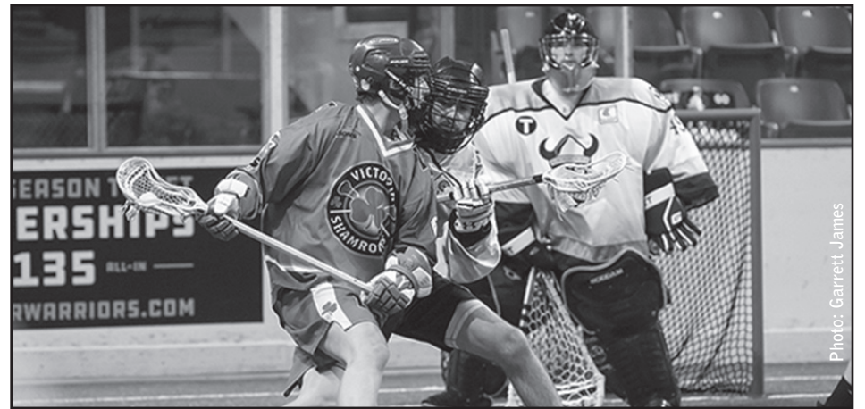
Victoria Shamrocks made the Minto finals but lost 3-0 to Orangeville Northmen.