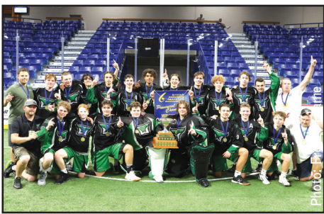
Midget A1 Gold-Juan de Fuca