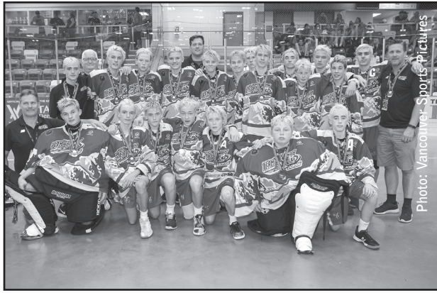
Team BC Bantam Boys-Silver.