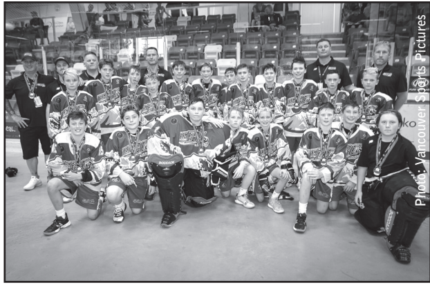
Team BC Pee Wee Boys-Silver.