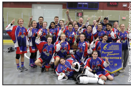
Female Bantam B Gold-Victoria-Esquamalt