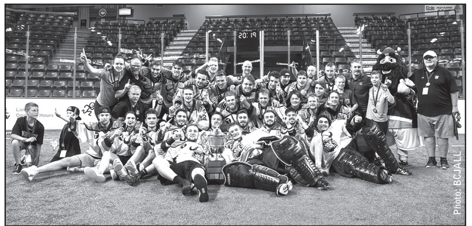
Orangeville sweeps Victoria 3-0 to win the 2019 Minto Cup.