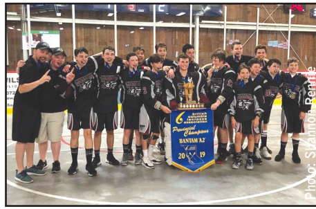
Bantam A2 Gold-Peninsula