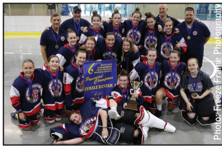
Female Bantam A Gold-Ridge Meadows