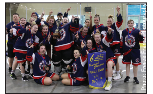
Female Junior Gold-Ridge Meadows