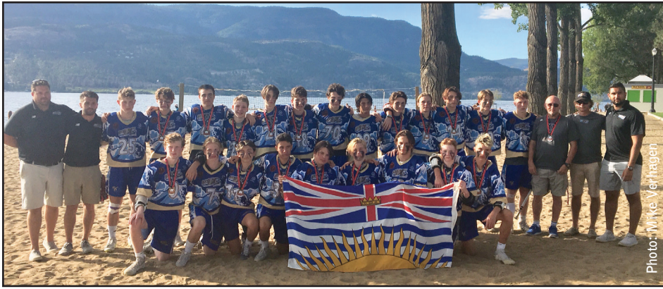
Team BC U15 settled for silver at 2019 Alumni Cup Field Nationals.