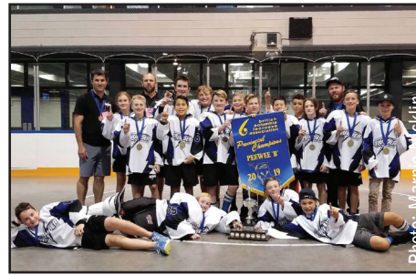
Pee Wee B Gold-Cowichan Valley