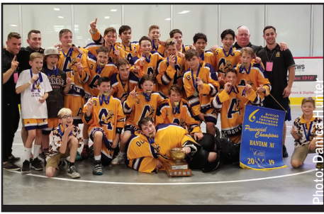
Bantam A1 Gold-Coquitlam