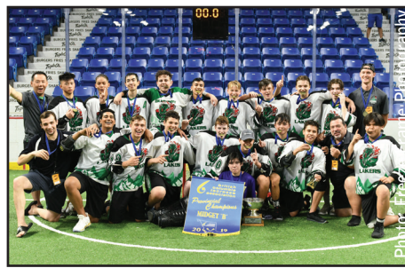
Midget B Gold-Burnaby