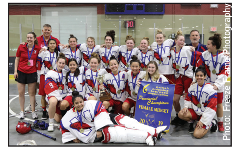
Female Midget Gold-New West