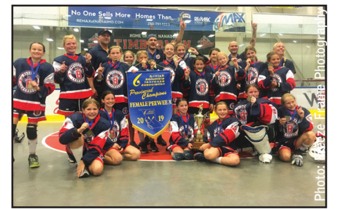
Female Pee Wee A Gold-Ridge Meadows