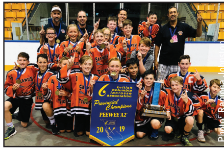
Pee Wee A2 Gold-Saanich