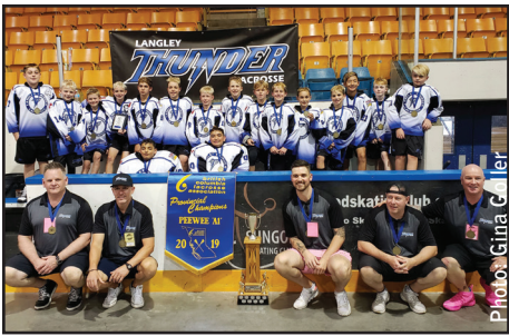
Pee Wee A1 Gold-Langley