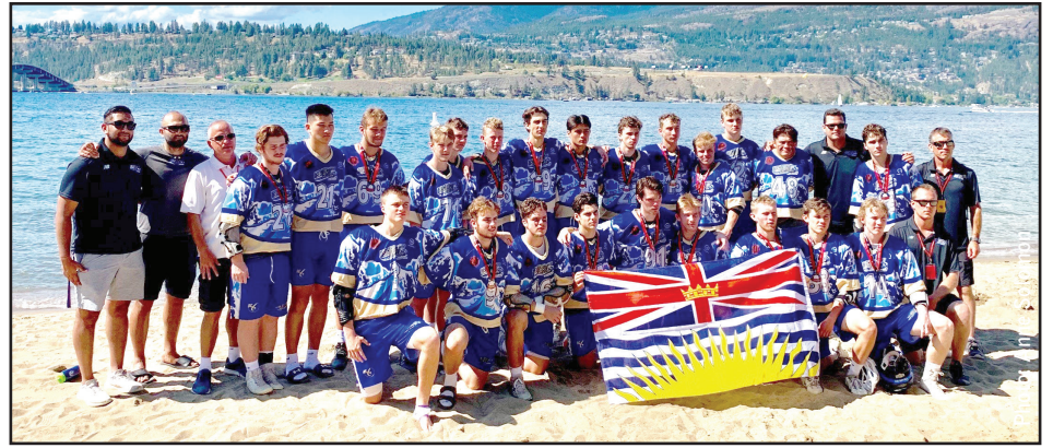
Team BC U18 settled for silver at 2019 First Nations Trophy Field Nationals.