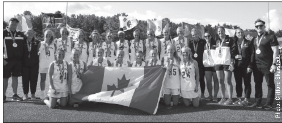
Team Canada U19 Women lost 13-3 to the USA in the 2019 Lacrosse World Cup Championships.