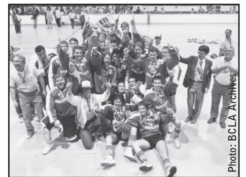
Whitby Warriors 1984 Minto Champions.