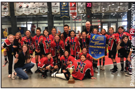
Female Pee Wee B Gold-Nanaimo