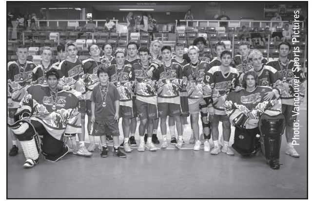
Team BC Midget Boys-Silver.