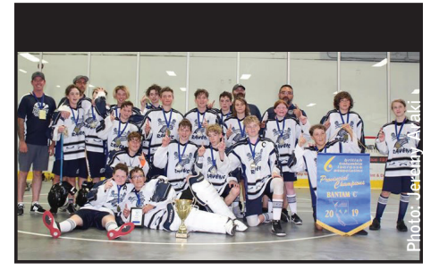
Bantam C Gold-Campbell River